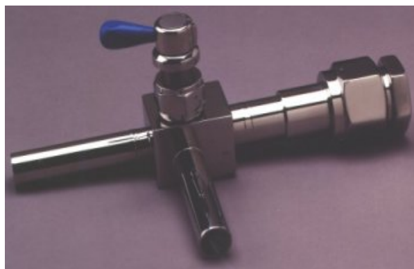
Ultra High Purity Excess Flow Valves, Manual Reset Series, shown here customized with 1/2" welded tube stubs

ChemTec does it all. From engineering & design to custom manufacturing, we are a one-stop-shop ready to meet the needs of our customers. All designing, manufacturing, assembling & testing is done in one place, our factory in Deerfield Beach, Florida.